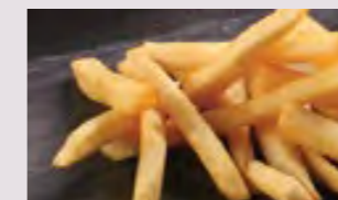
Swensen's Hot Fries