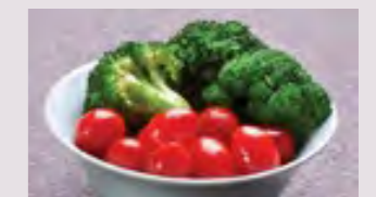
Seasonal Garden Veggies (based on what is freshly available)