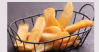
Steak Cut Fries