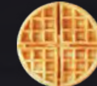
Swensen's Homemade Savory Waffle