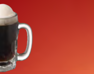
TREASURE ISLAND FLOAT