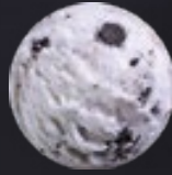
Cookies 'N' Cream