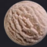
Salted Gula Melaka