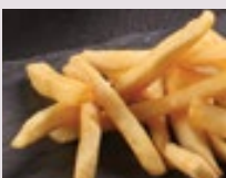
Hot Swensen's Fries