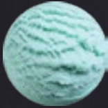
Tangy Lime Sherbet (with Marine Collagen)