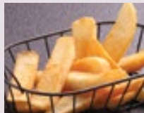
Steak Cut Fries