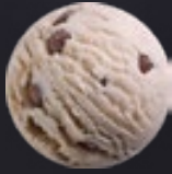
Nutty Hazel with Kit Kat