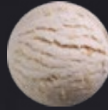
Salted Butterscotch Crumble