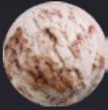
Chocolate Peanut Buttercup