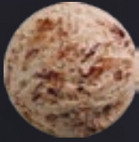
Mocha Almond Fudge