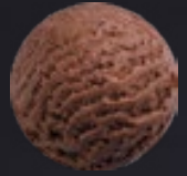
Sticky Chewy Chocolate