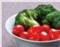
Seasonal Garden Veggies (based on what is freshly available)

Still feeling hungry? Top up $3.00 for an additional side of your choice! Limited to 1 top-up per grilled dish.