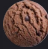
Dark Chocolate Truffle (with Truffle Oil)